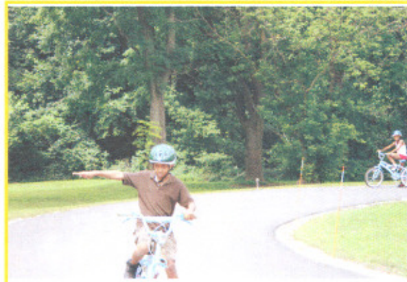
Practicing hand signals in the Demon Driveway obstacle course.