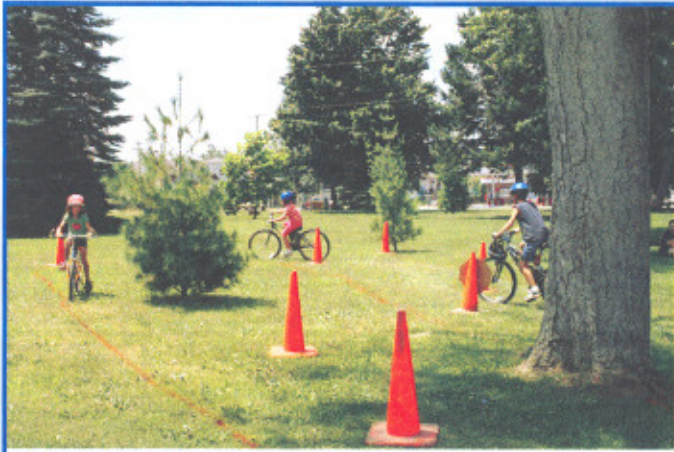
Obstacles are common when cycling and the Rock Dodge course provides the perfect practice for things that you can encounter while bicycling.