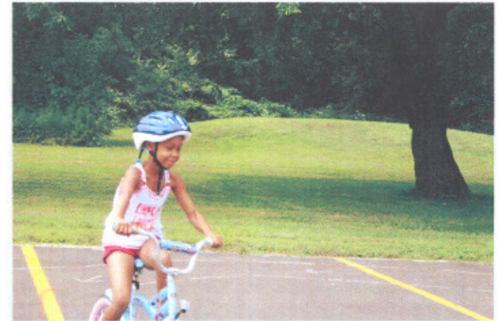
Faith under control and staying in the lines of the Figure 8, which teaches participants to break and maintain control of their bicycle.