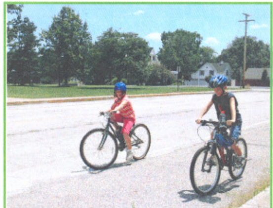
Practicing balance and control while going slow on the Slow Race!